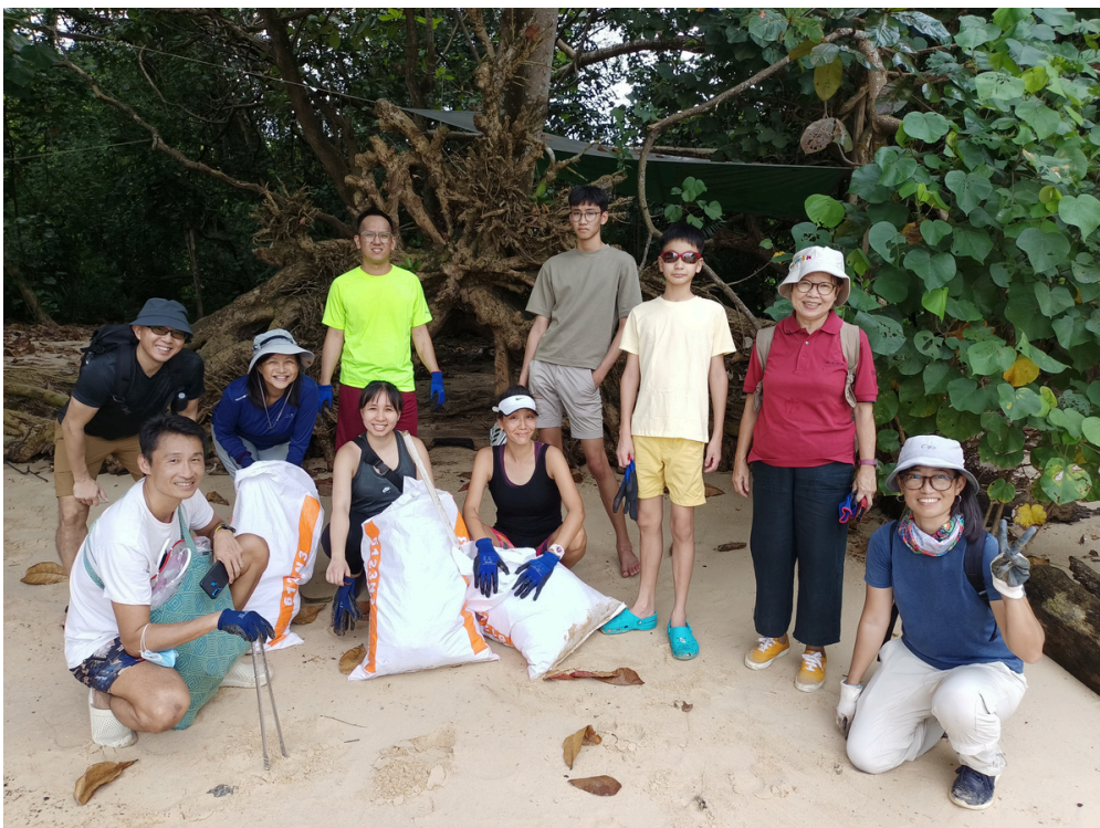
Friends of A Rocha Singapore during the International Coastal Cleanup, 2022

If you find another person willing to do a litter clean-up with you, congratulations: you have a core group! If you struggle to develop a core group, either postpone your date and keep searching for likeminded people, or continue planning and look for a core group from among those who attend the first event.