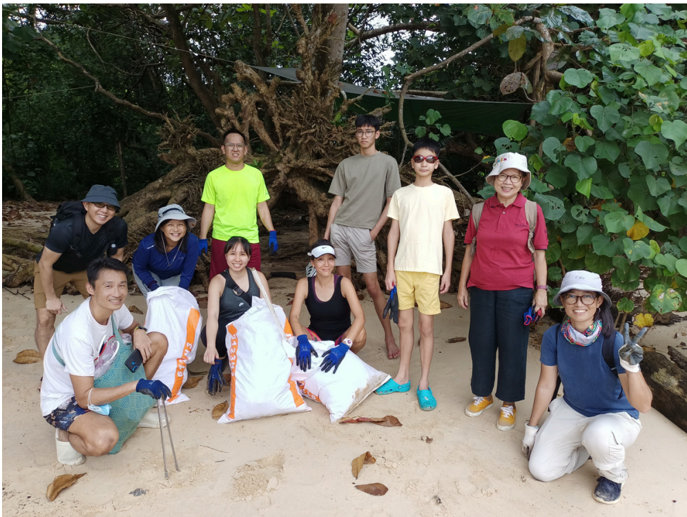
Friends of A Rocha Singapore during the International Coastal Cleanup, 2022

If you find another person willing to do a litter clean-up with you, congratulations: you have a core group! If you struggle to develop a core group, either postpone your date and keep searching for likeminded people, or continue planning and look for a core group from among those who attend the first event.